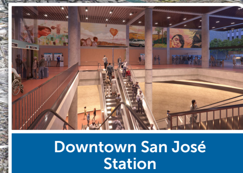
Downtown San José Station