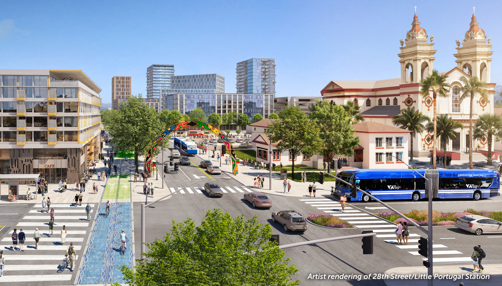
Artist rendering of 28th Street/Little Portugal Station