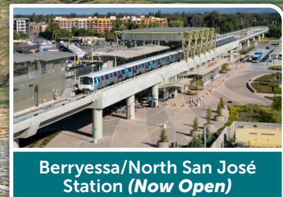
Berryessa/North San José Station (Now Open)