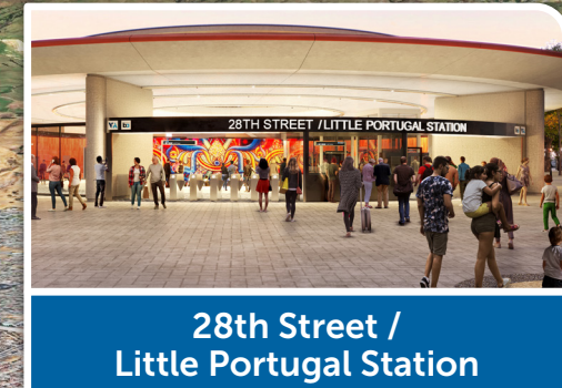
28th Street / Little Portugal Station