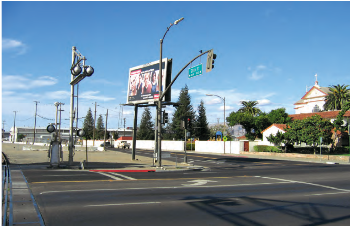
Existing View of Alum Rock Station and Parking Garage Location (view to the north from East Santa Clara Street)