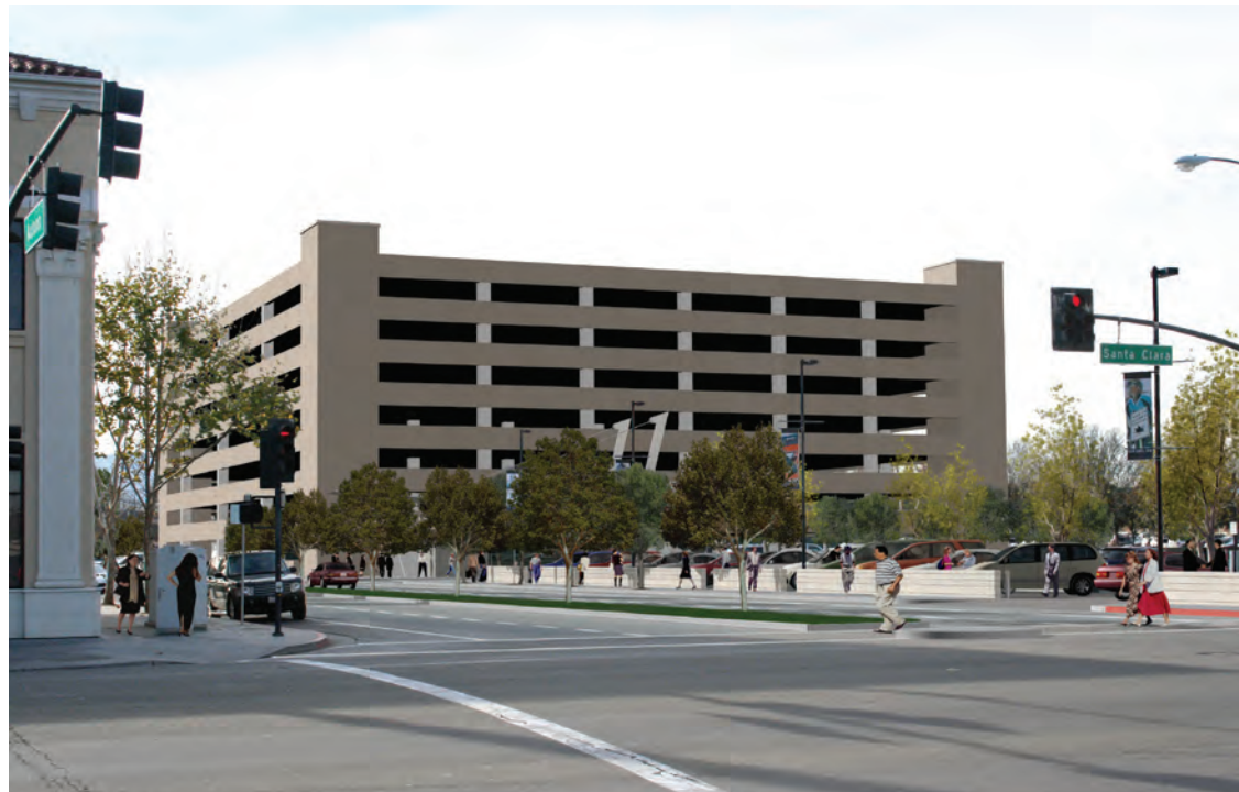
Visual Simulation of Diridon / Arena Station and Parking Garage (view to the south from north of Diridon Caltrain Station)