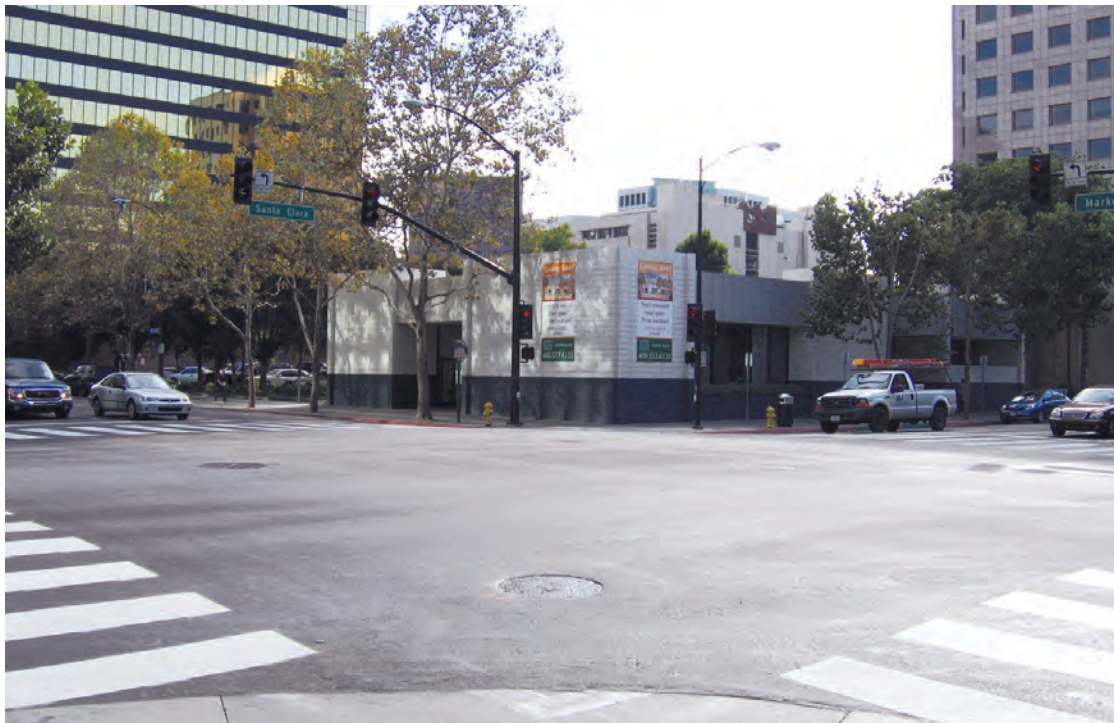
Existing View of Downtown San Jose Station Location (view looking southwest from northeast corner of Market Street and Santa Clara Street)