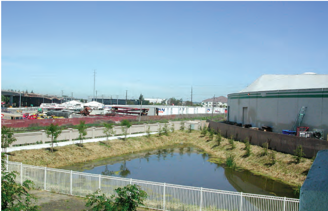
Existing View of Milpitas Station Location (view to the northwest from “The Crossings at Montague” apartments)