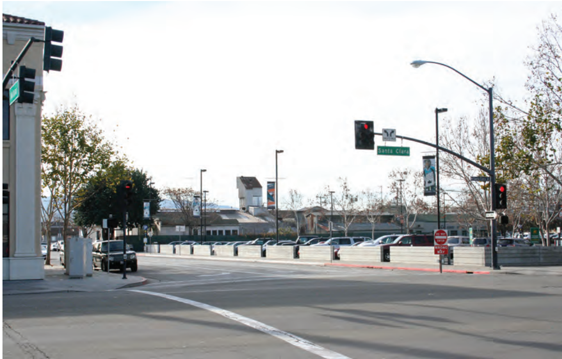
Existing View of Diridon / Arena Station and Parking Garage Location (view to the south from north of Diridon Caltrain Station)