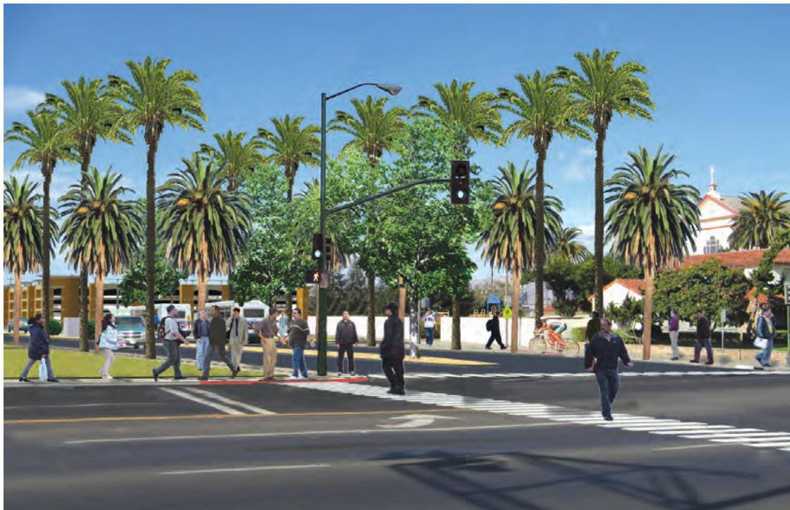
Visual Simulation of Alum Rock Station and Parking Garage (view to the north from East Santa Clara Street)