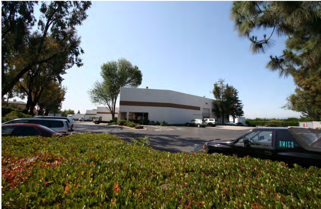
Existing View of Berryessa Station South Option Location (view to the southwest from the end of Salamoni Court)