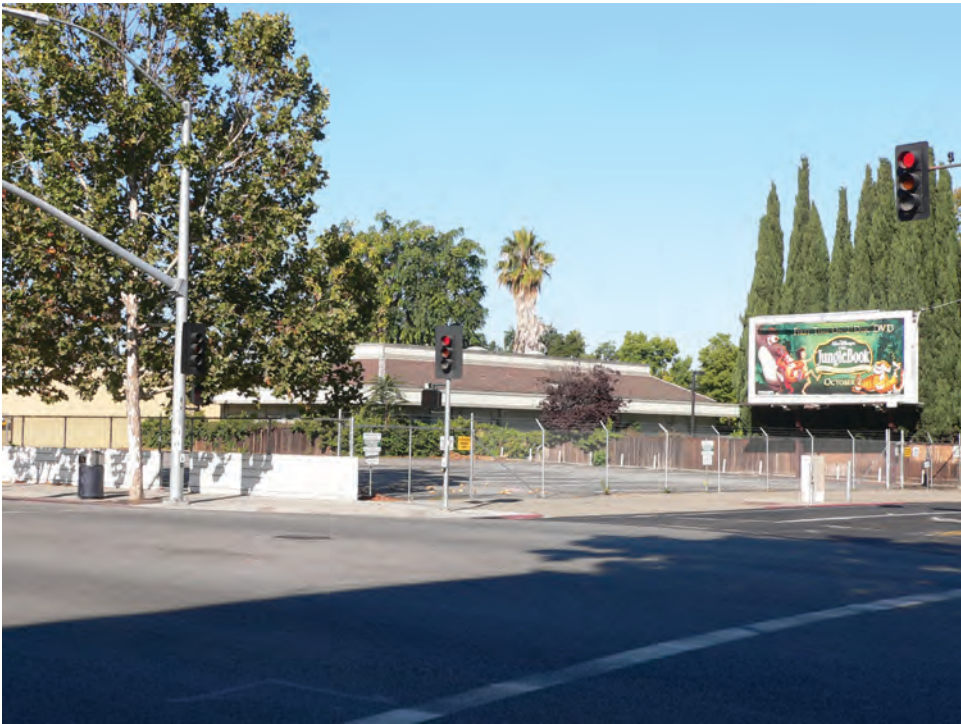
Existing View of the Vent Structure Location near Coyote Creek (view to the northwest from the East Santa Clara Street and North 13th Street intersection)