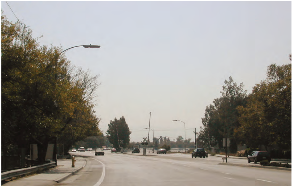
Existing View of Aerial Crossing Location at Berryessa Road (view to the southwest from Berryessa Road)