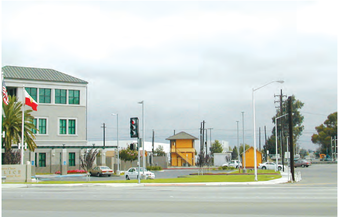
Existing View of Santa Clara Station and Parking Structure Location (view to the east from El Camino Real)