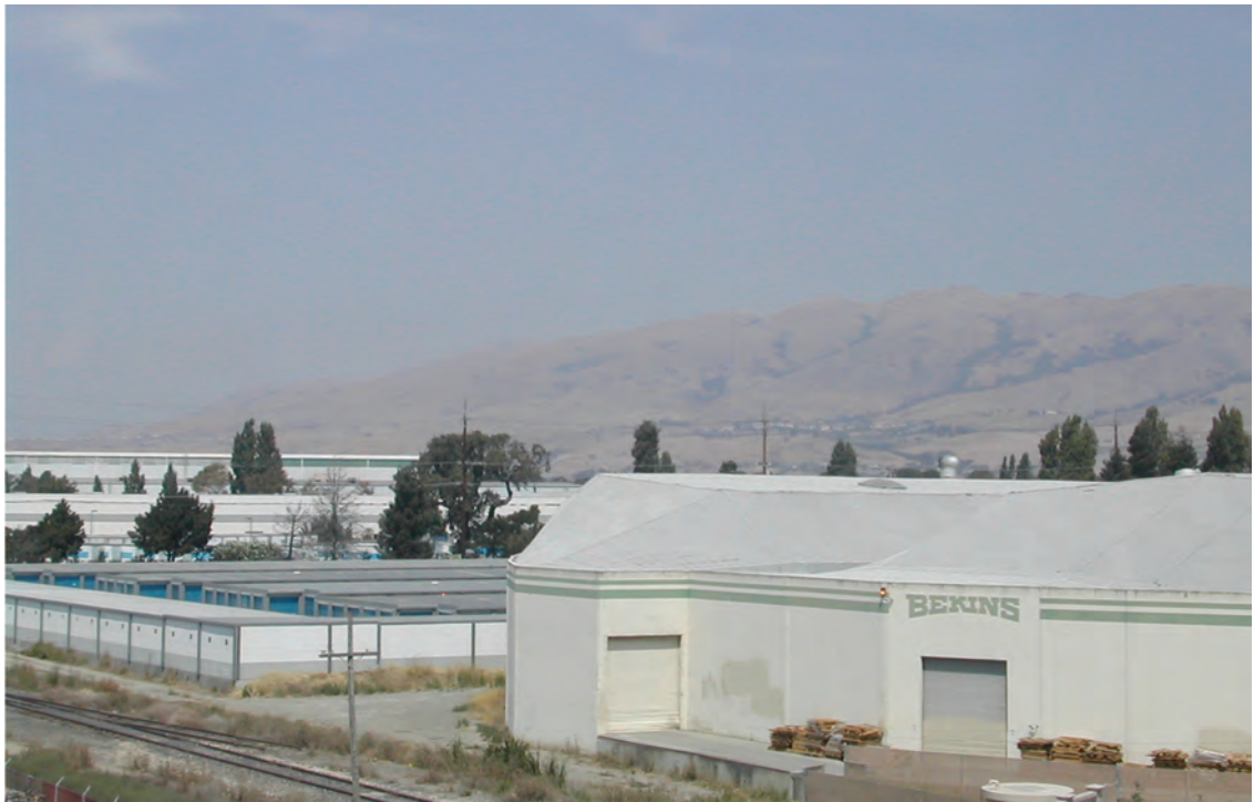
Existing View of Milpitas Station Location (view to the northeast from VTA Montague Light Rail Station)