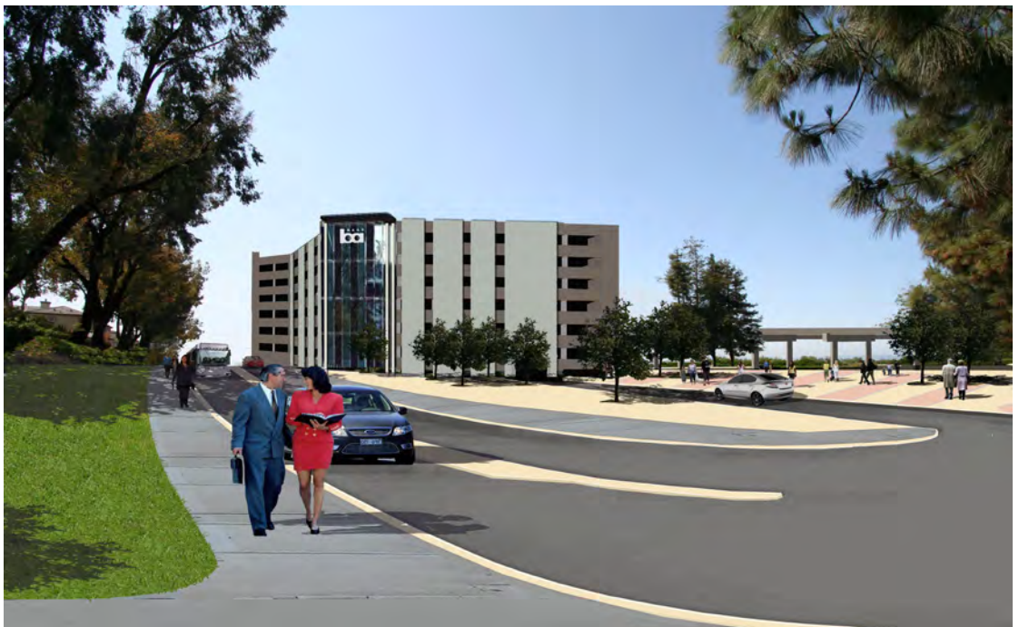
Visual Simulation of Berryessa Station North Option (view to the southwest from the end of Salamoni Court)