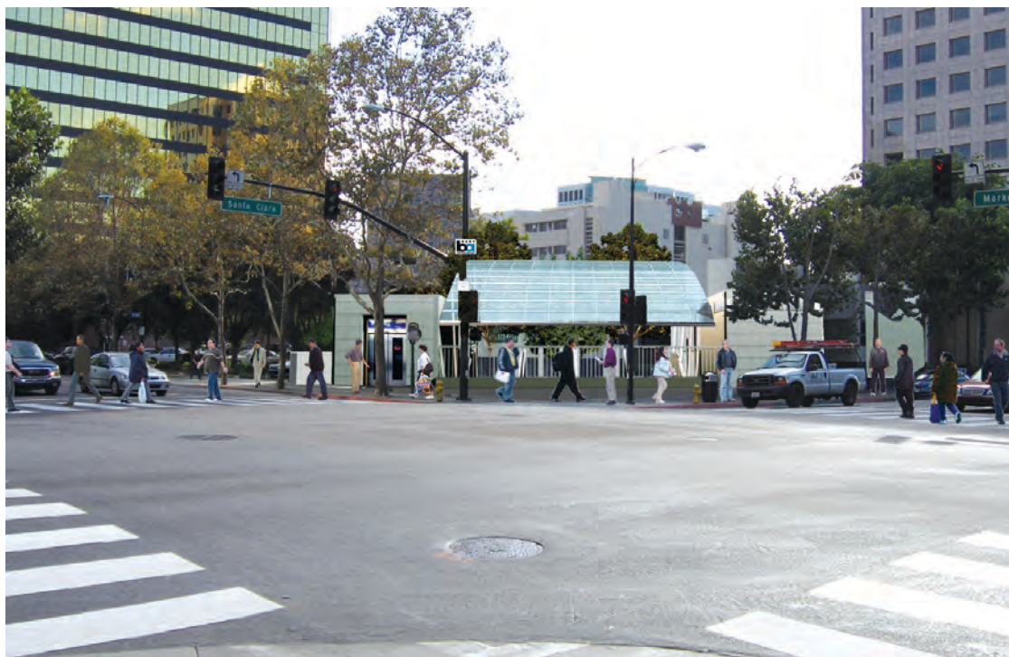
Visual Simulation of Downtown San Jose Station (view looking southwest from northeast corner of Market Street and Santa Clara Street)