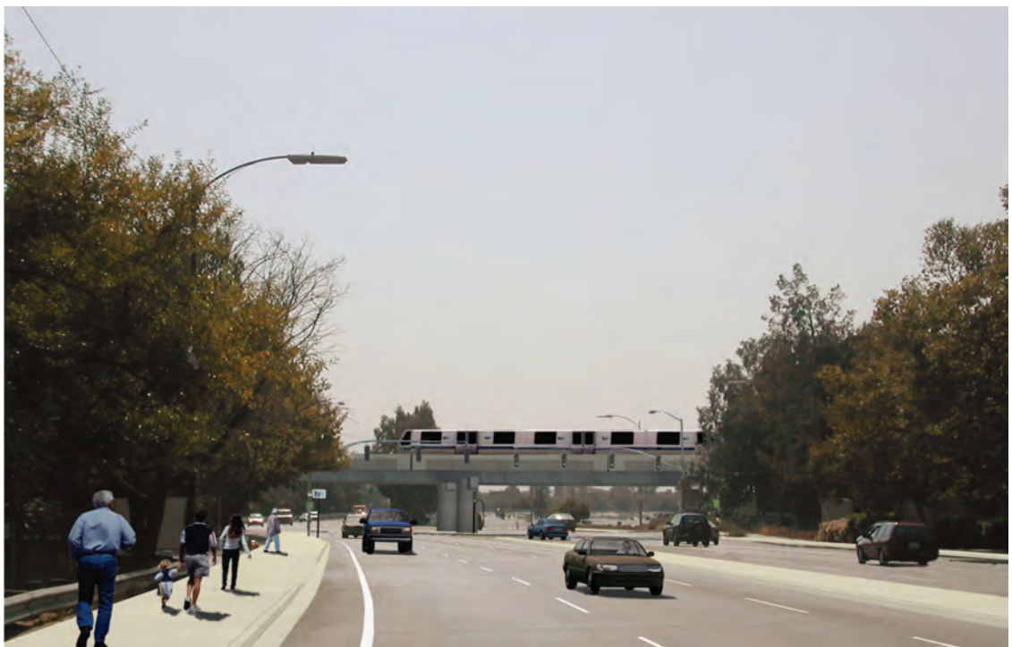
Visual Simulation of Aerial Crossing at Berryessa Road (view to the southwest from Berryessa Road)