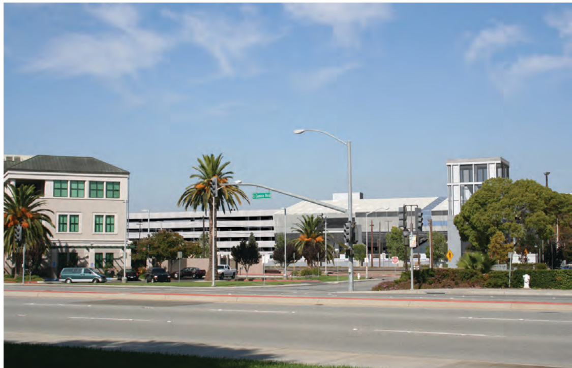
Visual Simulation of Santa Clara Station and 6 Level Parking Structure (view to the east from El Camino Real)