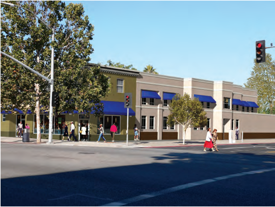
Visual Simulation of the Vent Structure near Coyote Creek (view to the northwest from the East Santa Clara Street and North 13th Street intersection)