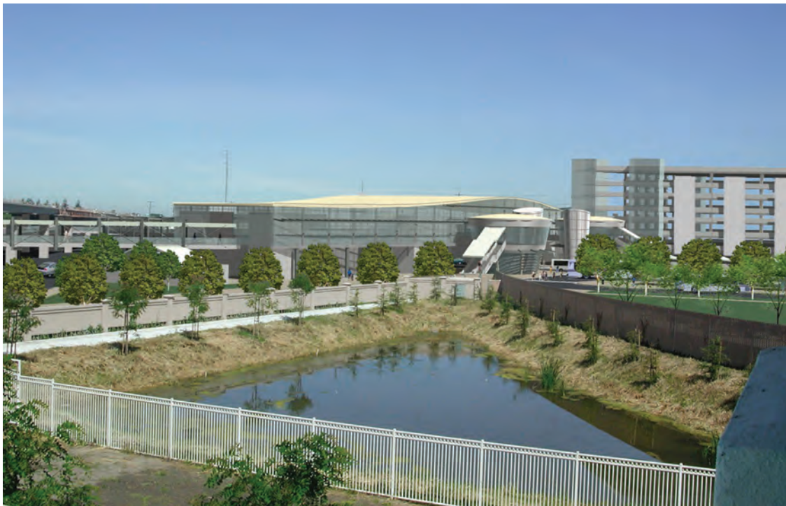
Visual Simulation of Milpitas Station (view to the northwest from “The Crossings at Montague” apartments)