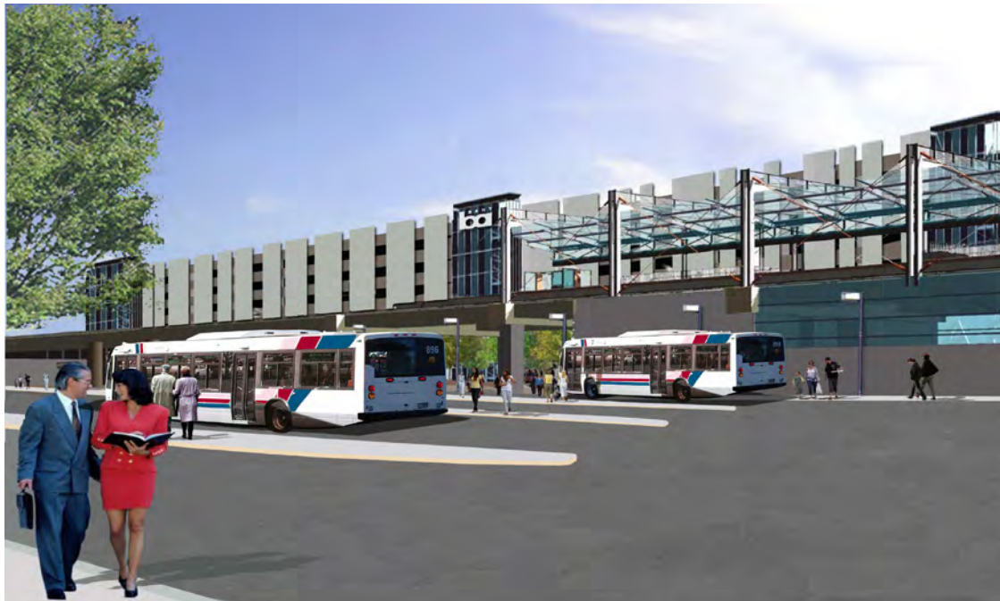
Visual Simulation of Berryessa Station South Option (view to the southwest near Salamoni Court)

Note: This simulation is from a location closer to the station than the existing view.