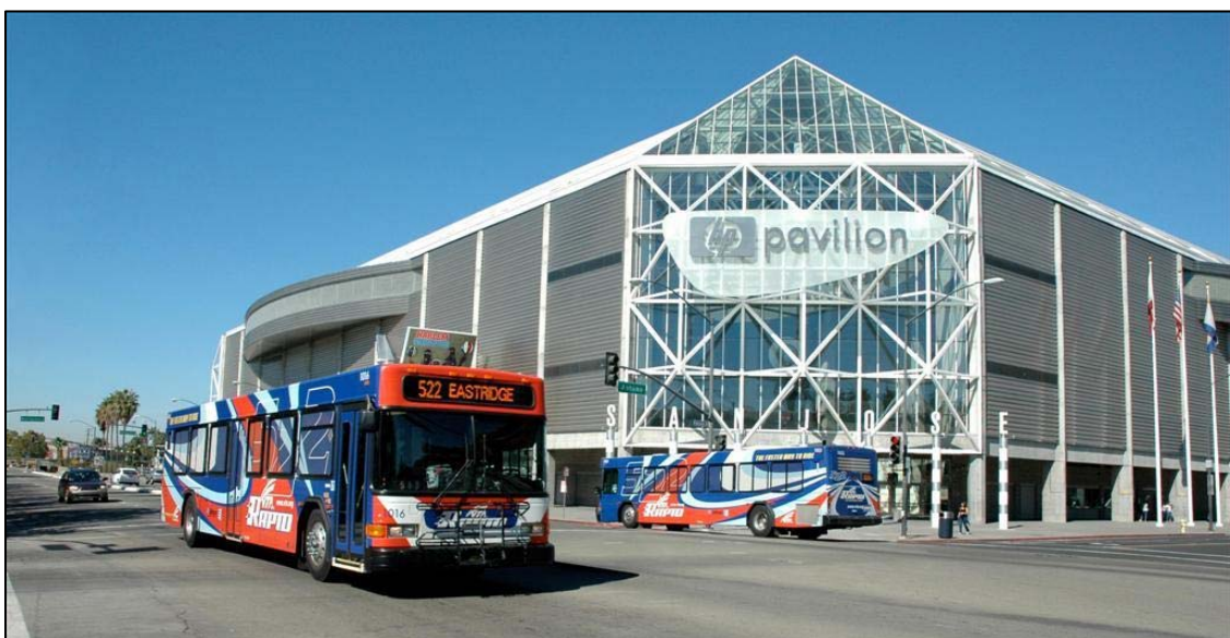
VTA Rapid 522 Buses at HP Pavilion