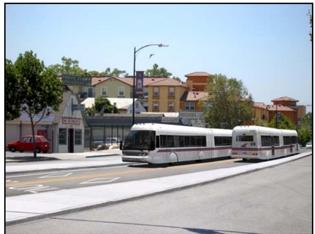
Simulations of Bus Rapid Transit along Santa Clara Street / Alum Rock Avenue