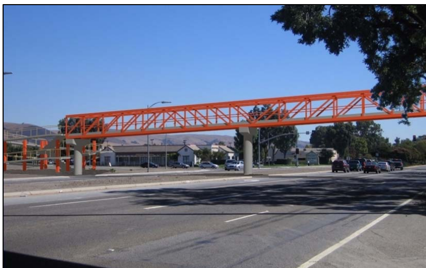
Conceptual Rendering of Blossom Hill Crossing