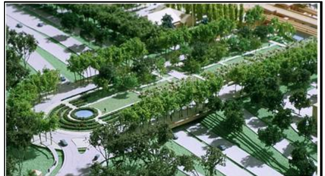
Architectural Model of One Proposed Scheme for a Public Park and El Camino Real Undercrossing