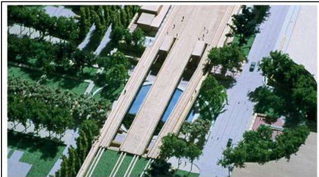
Architectural Model of One Proposed Scheme for the 4-Track Crossing of University Avenue