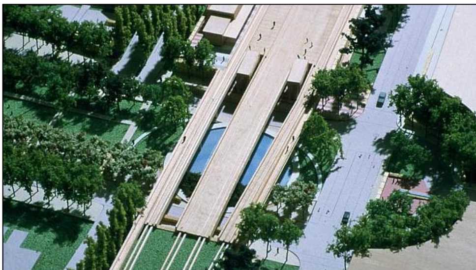
Architectural Model of One Proposed Scheme for the 4-Track Crossing of University Avenue