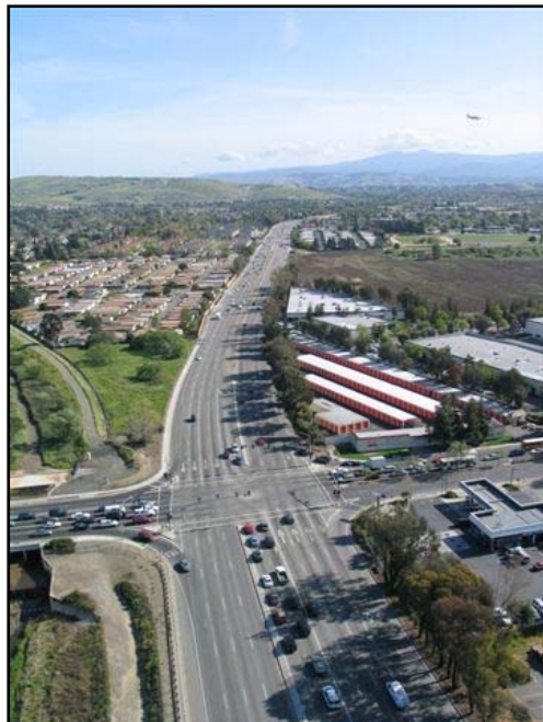
Aerial View of Project Alignment