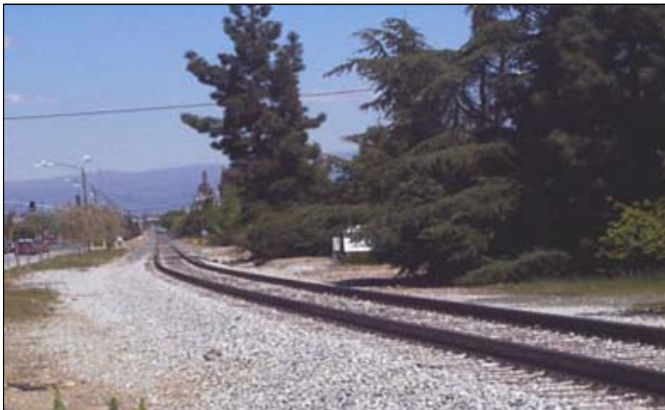
View of Proposed Alignment Looking North from the SR 85 Terminus.