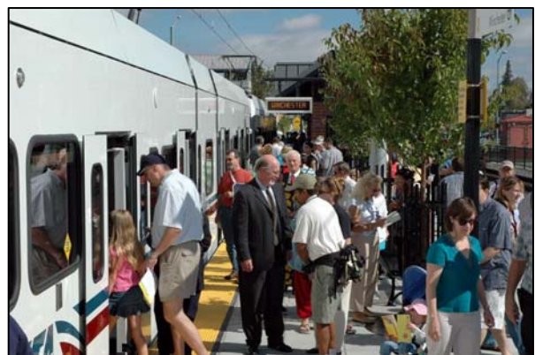
Low Floor Vehicles Provide Level Passenger Boarding