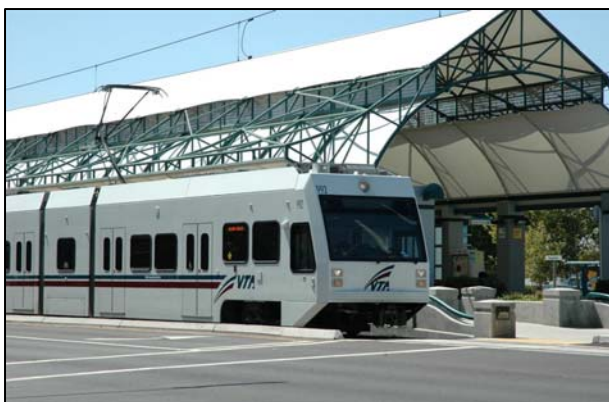
Low Floor Vehicle at Baypointe Station