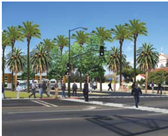
Figure 4.16-8: View simulation of the Alum Rock Station and Parking Garage (View to the north from East Santa Clara Street)

Design Change 34. Gap Breaker Station Near 22nd Street. This design change proposes a gap breaker station located on the north side of Santa Clara Street at 22 nd Street. The surrounding area is urbanized, and land uses are predominantly commercial with residential uses beyond. The size and mass of the gap breaker station would be designed to fit in with the surrounding urban environment so that it does not visibly conflict with the urban setting. VTA will continue to work with the city, community, and business groups in developing Project facilities compatible with the urban setting and streetscape. The visual changes caused by the gap breaker station would not have an adverse effect on a scenic vista, and would not substantially degrade the existing visual character or quality of the surrounding area.