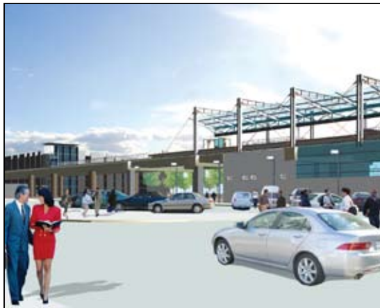
Figure 4.16-6: View simulation of the Berryessa Station and Parking Garage (View to the west from the industrial area east of the former UPRR railroad tracks)

Design Change 23. Berryessa Station. The Parking Structure Northeast Option is deleted and there are two new options for parking. With the Parking Structure with Surface Parking Option, a four- to six-level parking structure on 3.4 acres would be constructed in the same general location as the Parking Structure Southwest Option in the FEIR. Areas east of the rail ROW and north of Mabury Road would be acquired for surface parking. As shown in Figures 4.16-5 and 4.16-6, this option would result in the construction of a parking structure and surface