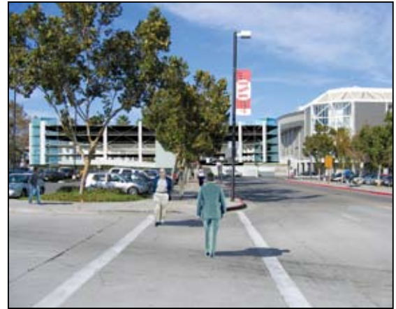
Figure 4.16-12: View simulation of the Diridon/Arena Station Parking Structure Option (View looking north from Cahill Street south of West Santa Clara Street)