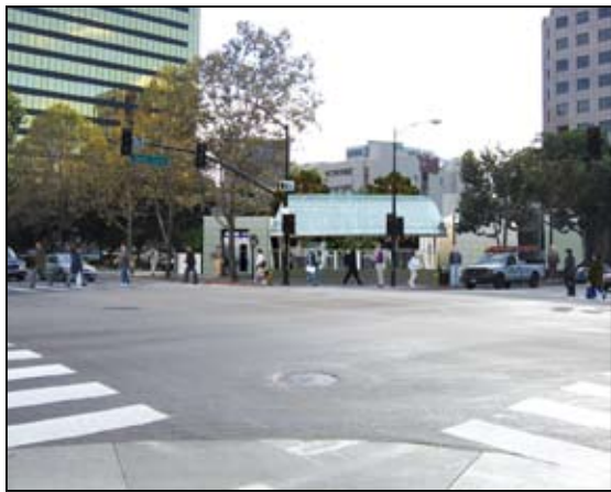
Figure 4.16-10: View simulation of the Downtown San Jose Station (View looking southwest from northeast corner of Market Street and Santa Clara Street)

Design Change 40. Downtown San Jose Station. The Downtown San Jose Station would be located underground between 4 th and San Pedro streets. Station entrances would be located between 2 nd and San Pedro streets, and the station would include two vent shafts. One shaft would be located north of East Santa Clara Street between 2 nd and 3 rd streets. The other vent shaft would be located at the southwest corner of West Santa Clara and Market streets. As shown in Figure 4.16-9 and 4.16-10, although the BART station would be underground, station entrances would be visible aboveground. However, as concluded in the FEIR for the Civic Plaza/SJSU and Market Street stations, the station entrances would not be dominant features in comparison to the existing buildings in the area. The design of the