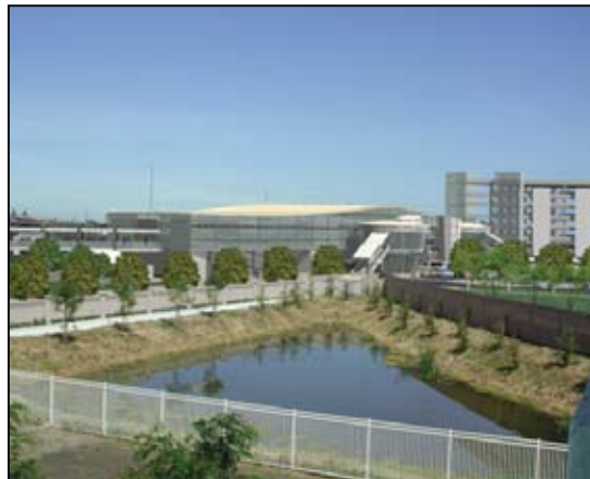
Figure 4.16-4: View simulation of the Montague/Capitol Station (View to the northwest from "The Crossings at Montague" apartments)

Design Change 21. Communication Facilities South of Hostetter Road. This design change proposes to locate a train control building immediately south of Hostetter Road on the east side of the railroad ROW. The surrounding area is urbanized, and land uses are predominantly residential with a few commercial uses. The size and mass of the train control building would be designed to fit in with the surrounding urban environment so that it does not visibly conflict with the urban setting. VTA will continue to work with the city, community, and business groups in developing Project facilities compatible with the urban setting and streetscape. The visual