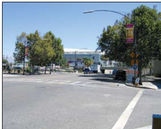
Figure 4.16-13: Current view of the Diridon/Arena Station Parking Structure Option Location (View looking east from The Alameda/Bush Street intersection)