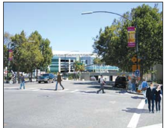
Figure 4.16-14: View simulation of the Diridon/Arena Station Parking Structure Option (View looking east from The Alameda/Bush Street intersection)