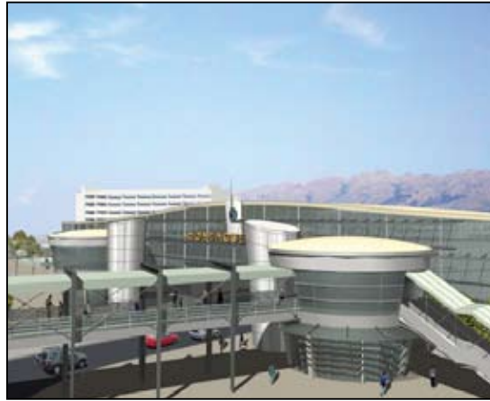
Figure 4.16-2: View simulation of the Montague/Capitol Station (View to the northeast from VTA Montague Light Rail Station on