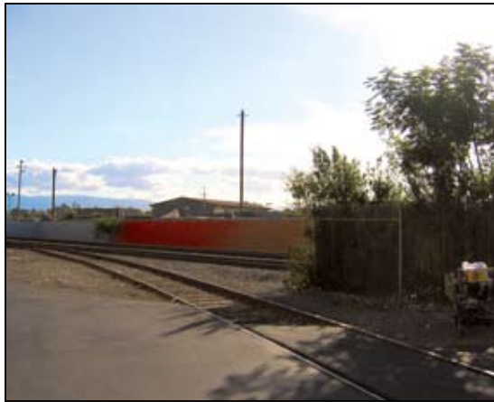
Figure 4.16-5: Current view of the Berryessa Station Location (View to the west from the industrial area east of the former UPRR railroad tracks)

Berryessa Road is to the north. Adding a traction power substation at this location would not have a substantial adverse effect on a scenic vista, and would not substantially degrade the existing visual character or quality of the area or its surroundings.