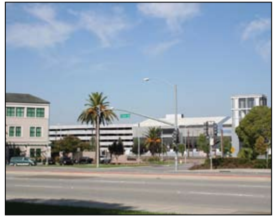
Figure 4.16-17: View simulation of the Santa Clara Station – 6 Level Parking Structure and Aerial Walkway (View to the east from El Camino Real)

Design Change 52. Santa Clara Station. The at-grade station would be constructed primarily between the Caltrain tracks to the west, Coleman Avenue to the east, and Brokaw Road to the south. This would result in the displacement of the Federal Express site. The station would include a 700-foot-long, 28-foot-wide center platform with a mezzanine one level above. An approximately 400-foot-long pedestrian connection would extend from the mezzanine level to the Santa Clara Caltrain Station to the west and a five-bay bus transit center and kiss-and-ride area to the east.