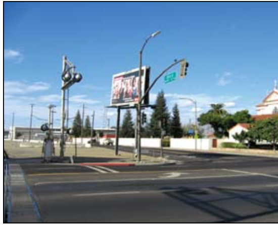
Figure 4.16-7: Current view of the Alum Rock Station and Parking Garage Location (View to the north from East Santa Clara Street)