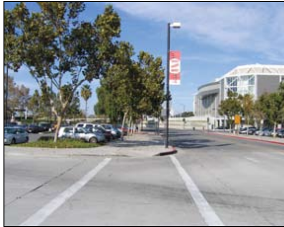
Figure 4.16-11: Current view of the Diridon/Arena Station Parking Structure Option Location (View looking north from Cahill Street south of West Santa Clara Street)

Cahill Street. With the South Bus Transit Center Option, the facility would be located north of San Fernando Street between Cahill and Montgomery streets. This urban area is developed with roadways, parking lots, and transportation-related infrastructure; the addition of a bus transit center would not have an adverse effect on a scenic vista, and would not substantially degrade the existing visual character or quality of the surrounding area.