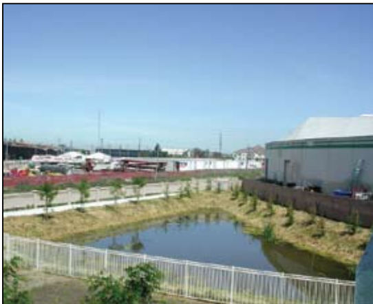
Figure 4.16-3: Current view of the Montague/Capitol Station location (View to the northwest from "The Crossings at Montague" apartments)