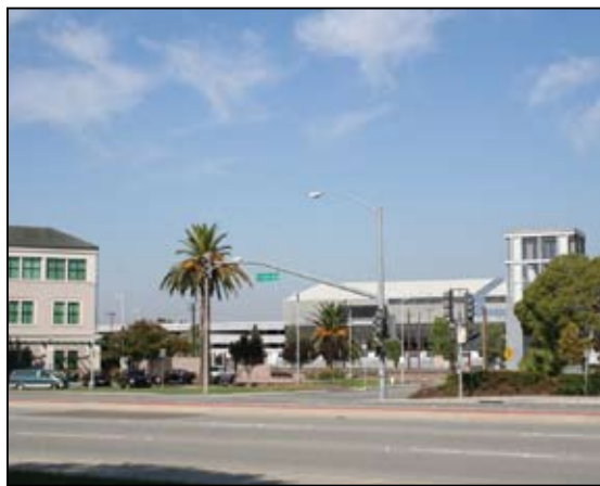
Figure 4.16-16: View simulation of the Santa Clara Station – 4 Level Parking Structure and Aerial Walkway (View to the east from El Camino Real)