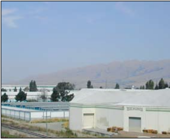
Figure 4.16-1: Current view of the Montague/Capitol Station location