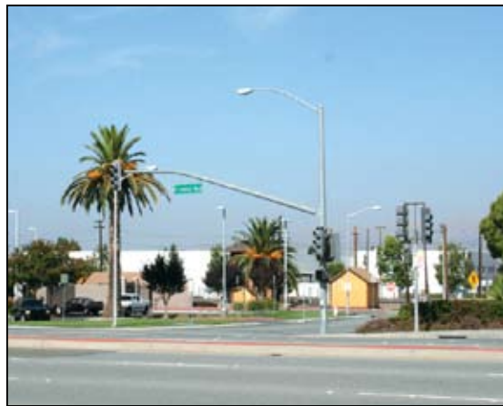
Figure 4.16-15: Current view of the Santa Clara Station and Parking Structure Location (View to the east from El Camino Real)

and Newhall Street would be moved to the tailtrack area in Santa Clara. Although uses within the yard change with regard to building sites, all structures and facilities would be located within the smaller yard and shops area that is bounded by I-880 to the south, railroad tracks to the west, and approximately De La Cruz Boulevard to the north. As discussed in the FEIR, the yard area is industrial in nature, and the uses described would be compatible with the existing railroad yard uses and industrial character and quality. The Yard and Shops Facility would not have an adverse effect on a scenic vista and would not substantially degrade the existing visual character or quality of the surrounding area. Lighting at this facility would be downward facing, and would be consistent with the industrial location.