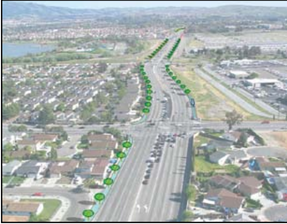
Phase I - Pedestrian Safety Improvements on Capitol Expressway

Phase I of the project will include pedestrian and bus improvements along Capitol Expressway to accommodate pedestrian access and to improve safety. The project includes