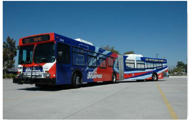
Rapid 522 Low-floor articulated bus with capacity for up to 97 passengers.

Special signage along the bus route denotes VTA Rapid Service stops.