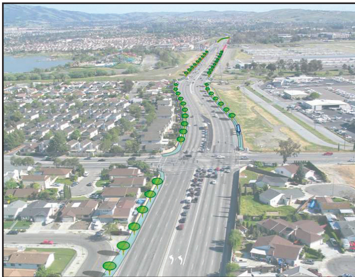
Phase I - Pedestrian Safety Improvements on Capitol Expressway

Phase I of the project will include pedestrian and bus improvements along Capitol Expressway to accommodate pedestrian access and to improve safety. The project includes new sidewalks, street lighting and a landscaping buffer between the sidewalk and the roadway from Capitol Avenue to Quimby Road. During this phase the reconstruction of the Eastridge Transit Center will take place. These improvements will also support subsequent rapid transit (RT) shelters and amenities at Story and Ocala as part of the future Santa Clara-Alum Rock RT service along Capitol Expressway.