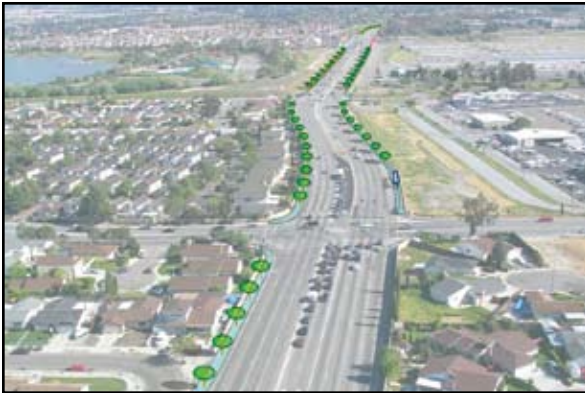
Phase I- Pedestrian and Bicycle Safety Improvements on Capitol Expressway

Phase I of the project will construct pedestrian and bicycle safety improvements along Capitol Expressway to support future transit services. To accommodate pedestrian and bicycle access and to ensure safety, the project includes a continuous landscaping buffer between the sidewalk and the roadway along the corridor, pedestrian lighting and signalized crosswalks.