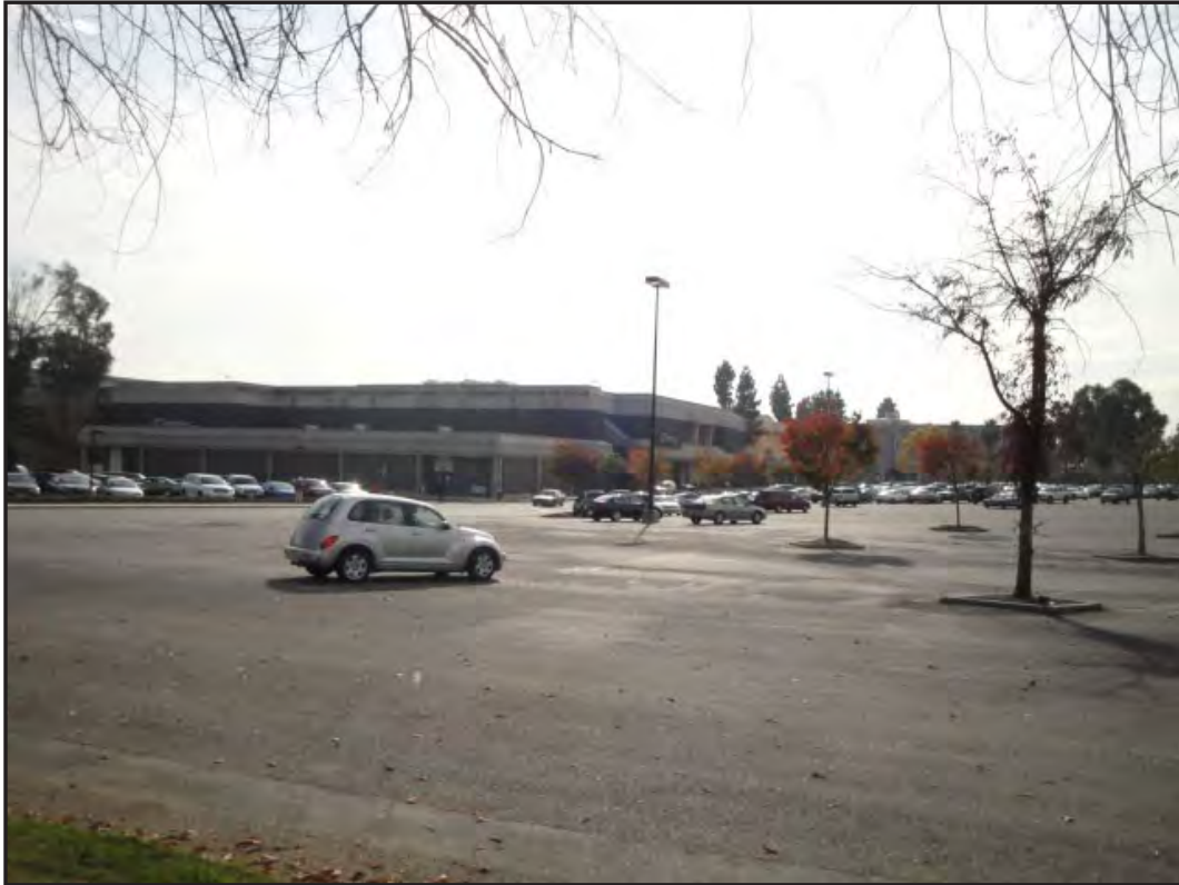
3.11-5. Eastridge Shopping Mall