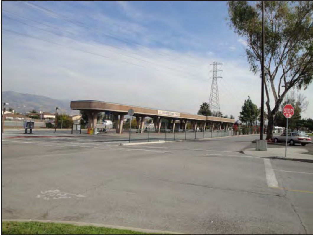
3.11-4. Eastridge Transit Center