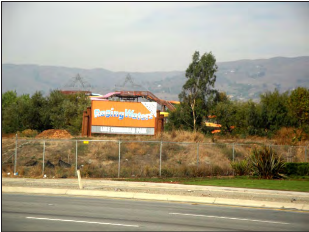
3.11-3b. Raging Waters