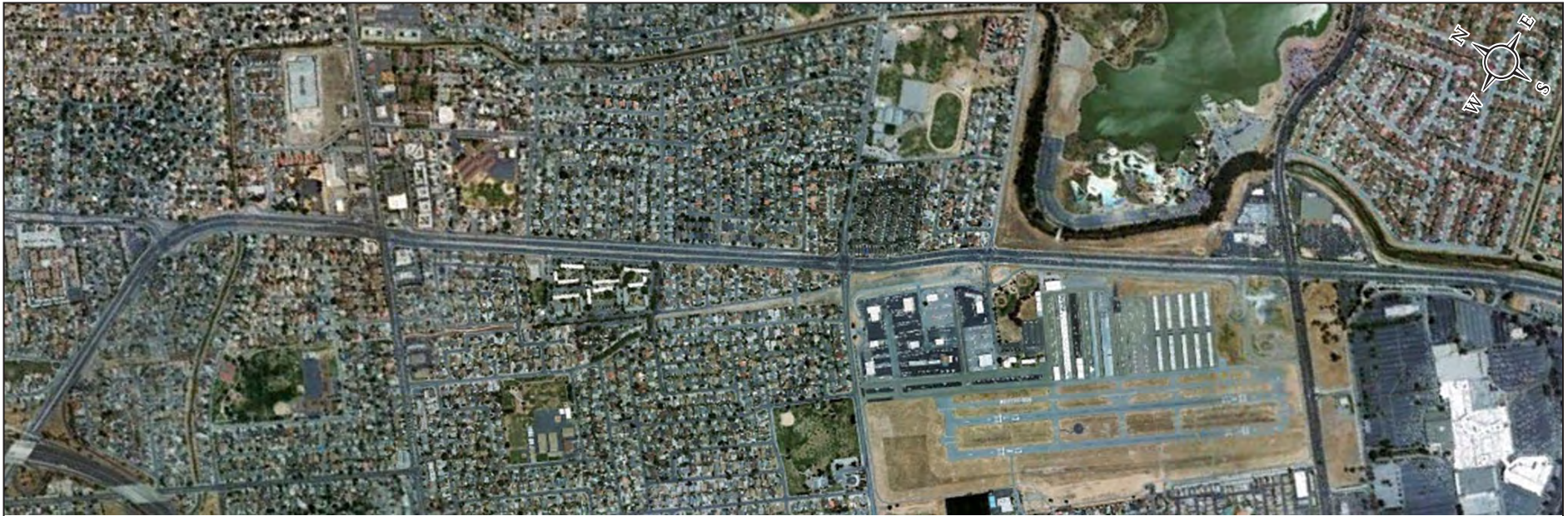
Aerial view of the Capitol Expressway Corridor