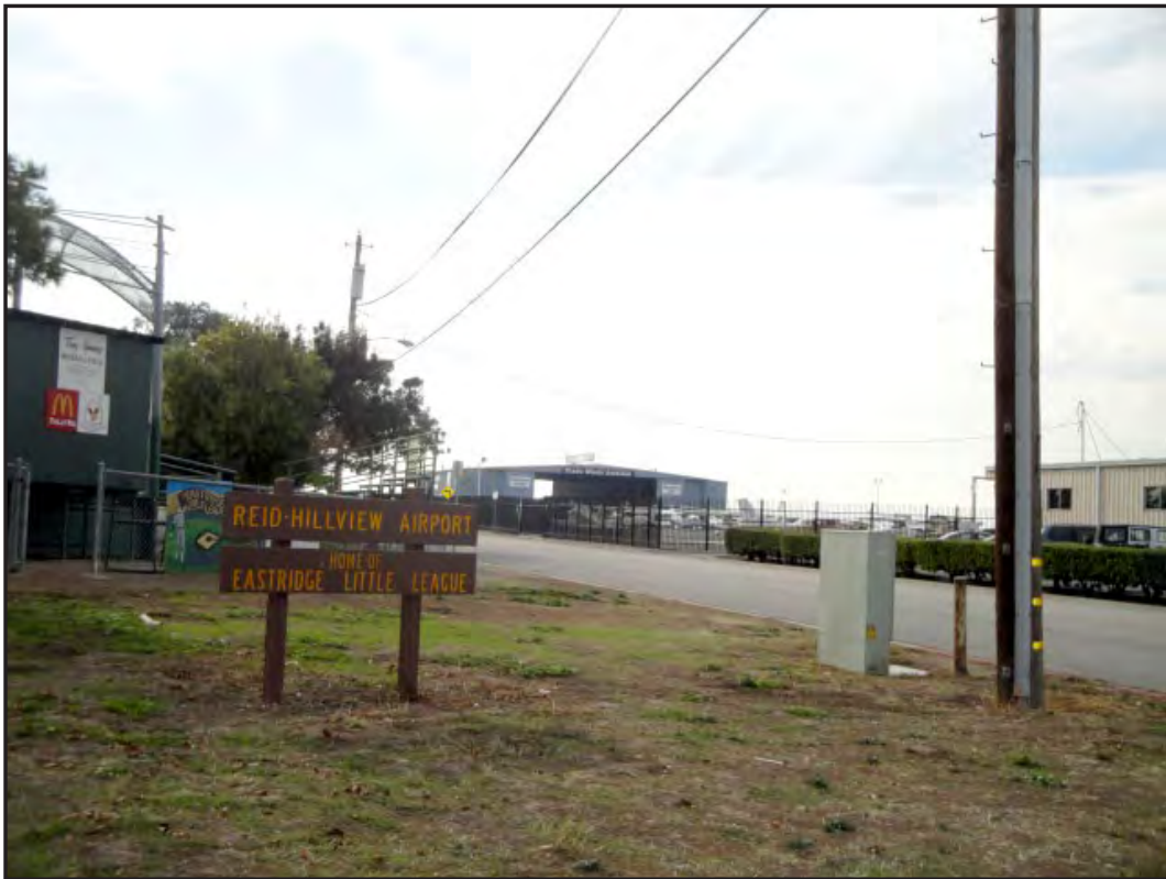
3.11-2b. Reid-Hillview Airport Ballfield and Hanger