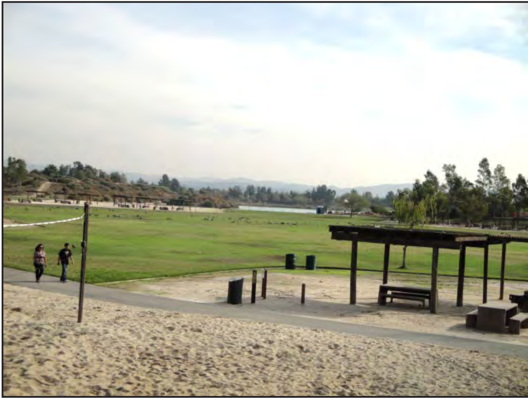
3.11-3a. Lake Cunningham Picnic Area