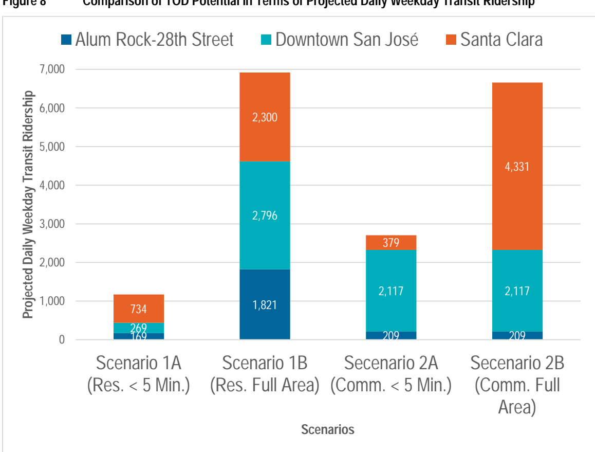
Figure 8 Comparison of TOD Potential in Terms of Projected Daily Weekday Transit Ridership

The model outputs<sup>33</sup> project substantial transit ridership gains with increases in both office space and residential units<sup>34</sup>. In all three stations, an increase in 1,000 square feet of office space nets approximately 1.03 additional riders, while an increase in one dwelling unit nets approximately 0.32 riders. For example: