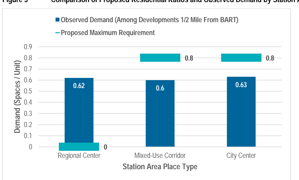
Figure 3 Comparison of Proposed Residential Ratios and Observed Demand by Station Area Place Type