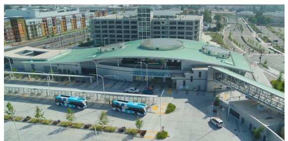
Milpitas Station (Looking East)