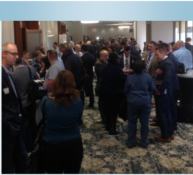
VTA's 2020 Industry Forum Featuring the BART Silicon Valley Exchange Phase II