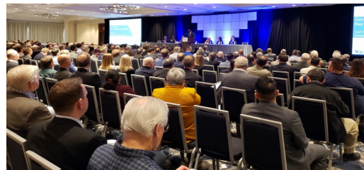
VTA's 2020 Industry Forum Featuring BART Silicon Valley Extension Phase II

We welcome all small and socially disadvantaged businesses to come and JOIN OUR TEAM now!