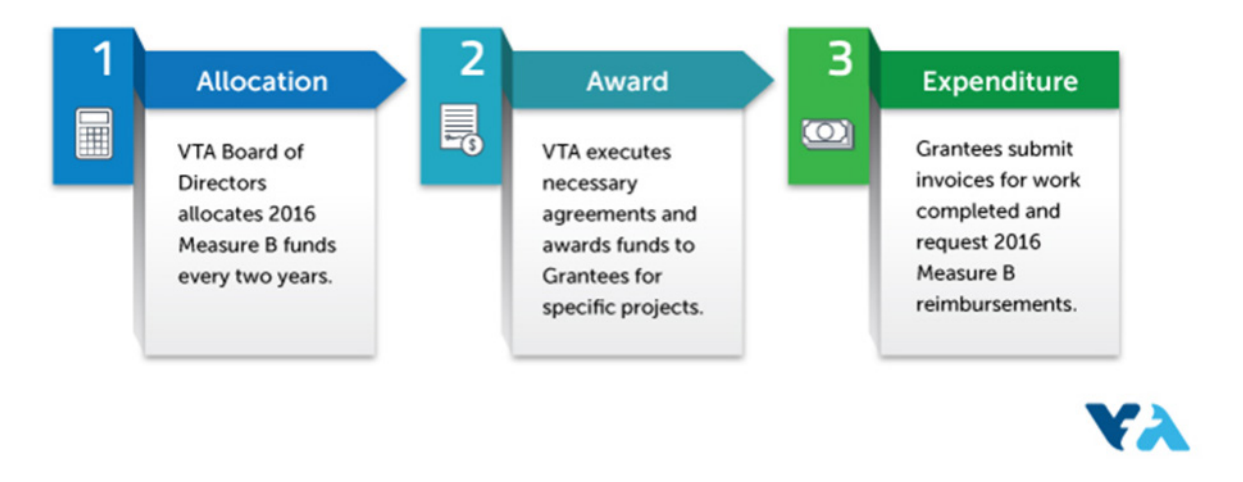
Figure 6.1 – 2016 Measure B allocation to expenditure process.

Figure 6.1 illustrates the general three-step distribution process of 2016 Measure B funds, from allocation to expenditure. The process begins with the VTA Board of Directors' approval of the Program Category allocations – this part of the process is done on a biennial basis, or every two years, in conjunction with VTA's budget cycle. Formula-based programs such as Local Streets and Roads and Bicycle & Pedestrian Education Encouragement, will have allocations that are further broken down to the 15 cities and the County. For example, the Local Streets and Road Program Category allocation is disbursed to each city using a population-based formula and to the County based on the County's road and expressway lane mileage.