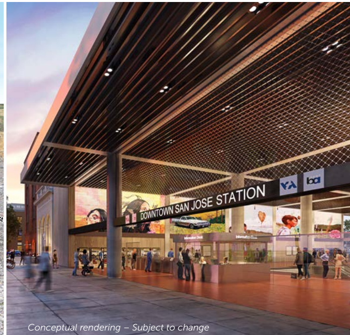
Conceptual rendering – Subject to change

Downtown San José Station will be on Santa Clara Street with the main station entrance between Market and 1st Streets and the secondary entrance between 1st and 2nd Streets. An emergency egress and ventilation facility will be at the northwest corner of 3rd Street. Ticketing and fare gates will be at street-level at both entrances while the station’s concourse and stacked platforms will be underground. There will be bicycle parking and convenient connections to VTA light rail and bus service on Santa Clara, 1st, and 2nd Streets. The station area will be integrated with planned on-site development, helping transition Downtown into a transit oriented community.