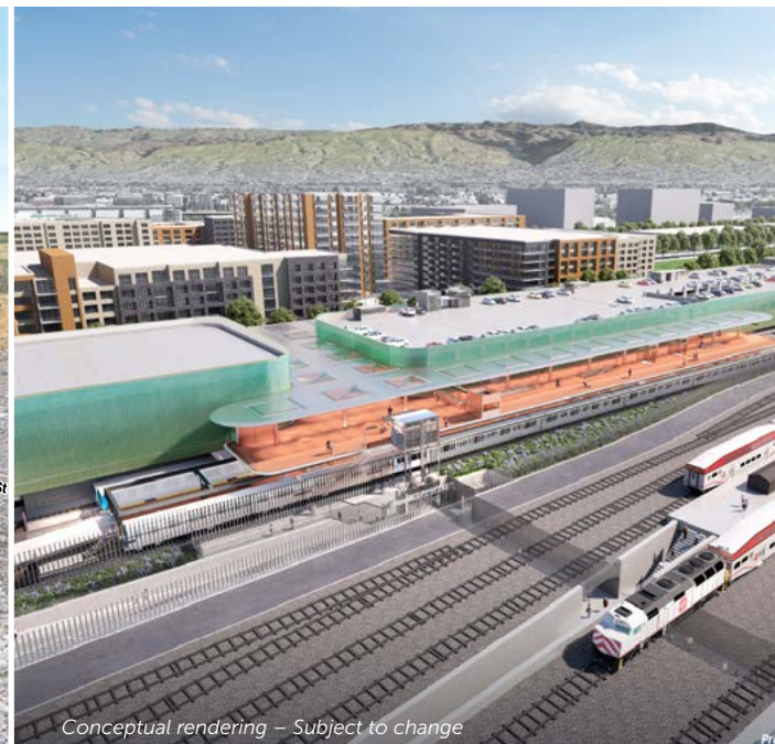
Conceptual rendering – Subject to change

Santa Clara Station, adjacent to the Santa Clara Caltrain Station and the future Gateway Crossings development, will be the end of the line station for VTA's BART Phase II Extension. Unlike the three other stations, the concourse will be elevated and the platform will be at ground level, similar to the Warm Springs BART Station. The station will include vehicle parking, bicycle facilities, and a connection to Caltrain, Capitol Corridor, Altamont Corridor Express, and several VTA bus lines through the existing Santa Clara pedestrian undercrossing.