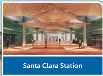
Santa Clara Station