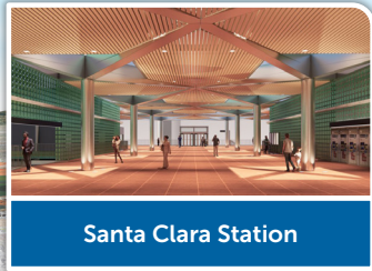
Santa Clara Station