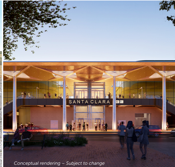
Conceptual rendering – Subject to change

Santa Clara Station, adjacent to the Santa Clara Caltrain Station and the future Gateway Crossings development, will be the end of the line station for VTA's BART Phase II Extension. Unlike the three other stations, the concourse will be elevated and the platform will be at ground level, similar to the Warm Springs BART Station. The station will include vehicle parking, bicycle facilities, and a connection to Caltrain, Capitol Corridor, Altamont Corridor Express, and several VTA bus lines through the existing Santa Clara pedestrian undercrossing.