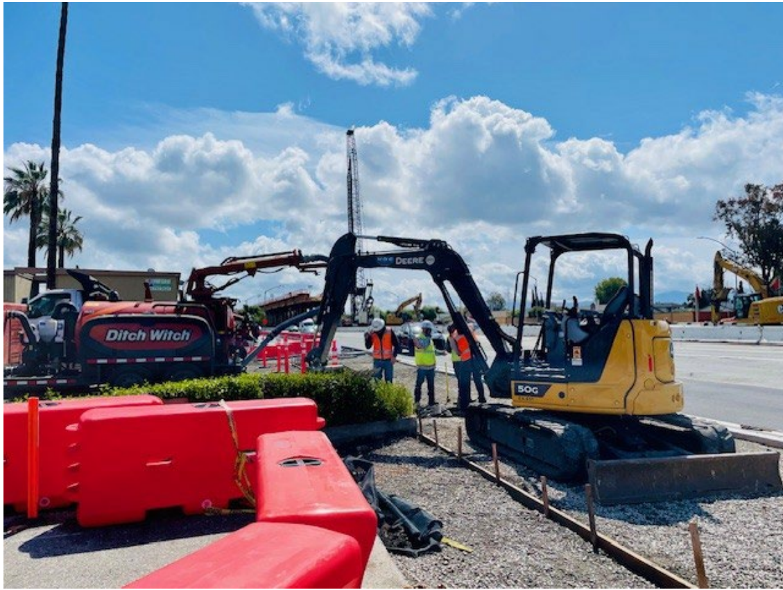
Crews adjusted an existing utility box on the west side of Capitol Expressway.