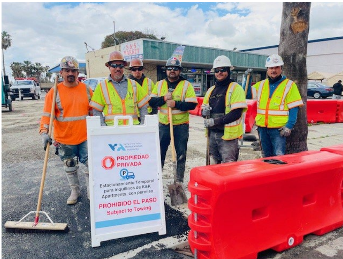
Journeymen finish cleaning storm debris close to Capitol Expressway and Story Road.