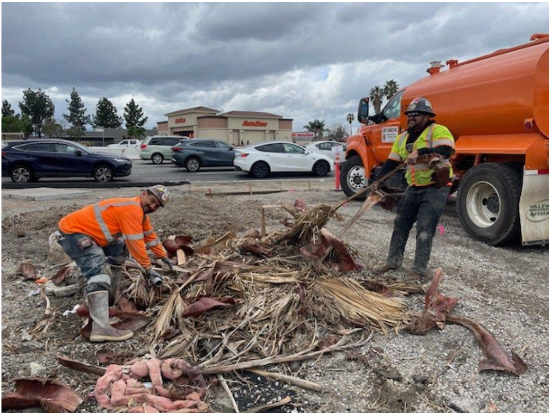
Journeymen finish cleaning storm debris close to Capitol Expressway and Story Road.