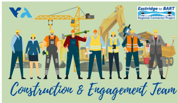
The Construction and Engagement Team