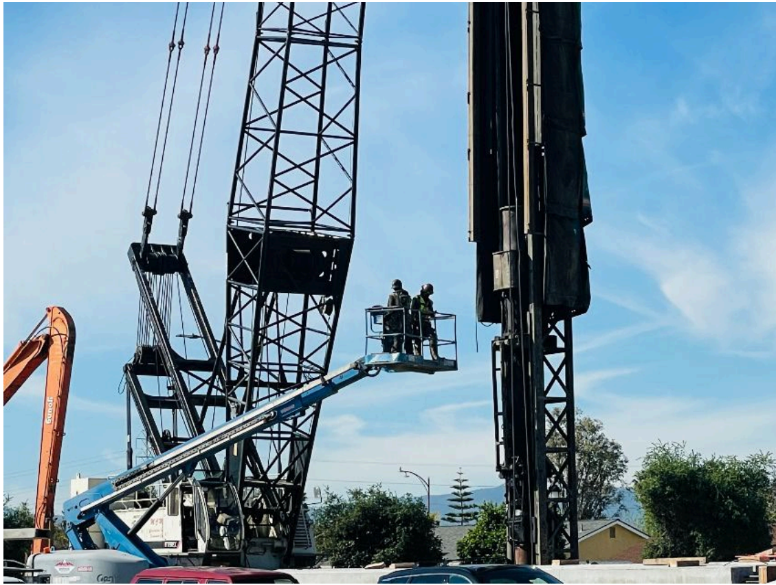
Workers fix a crane and other equipment near Story Road while testing for pile driving.