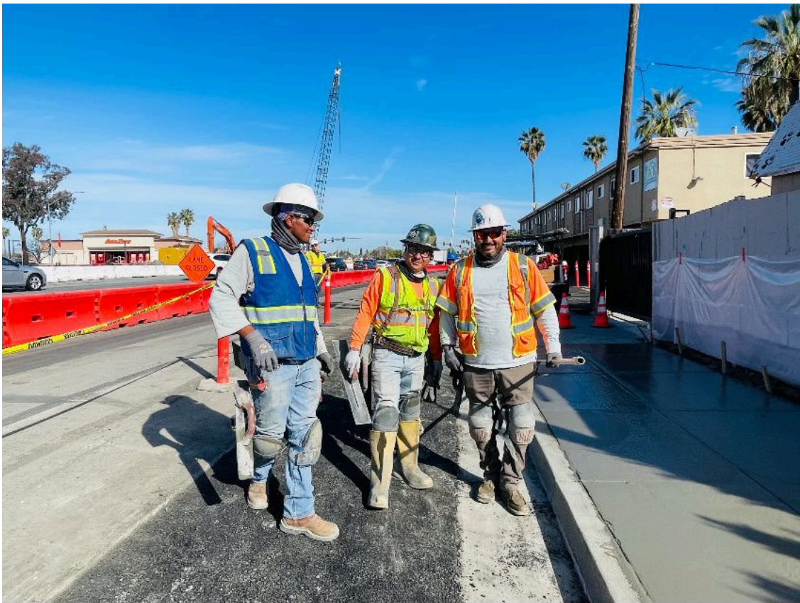
A crew of cement masons has been working on sidewalks and curbs on S. Capitol Avenue near Kollmar Drive and Sussex Drive.