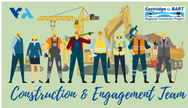
The Construction and Engagement Team