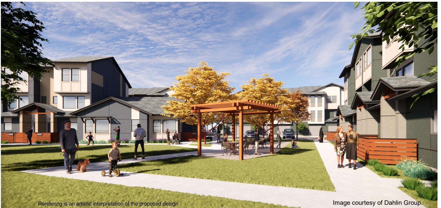
Rendering is an artistic interpretation of the proposed design.

VTA and the Santa Clara Office of Supportive Housing (OSH) have been working closely with Charities Housing to develop a 45-unit affordable home ownership project serving households between 30% to 120% of Area Median Income, including 10 units serving the lowest end of this range. Funded by CalHOME, Destination HOME, Santa Clara County, and the City of San Jose, this project will enable families to build equity through a long-term VTA ground lease, recycling wealth-building opportunities for future generations. Several units will incorporate junior ADUs, providing flexibility for intergenerational living.