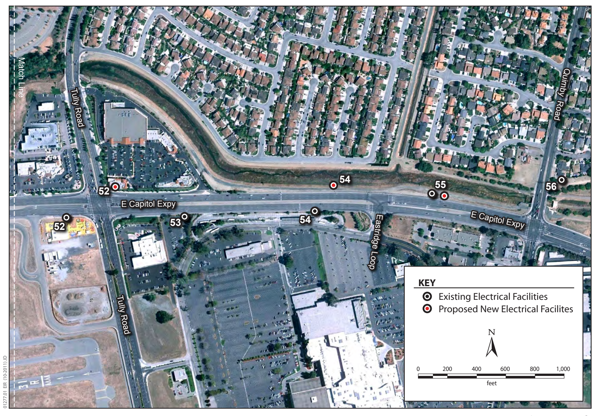
Figure 3.15-2b Proposed Changes to Electrical Transmission Facilities