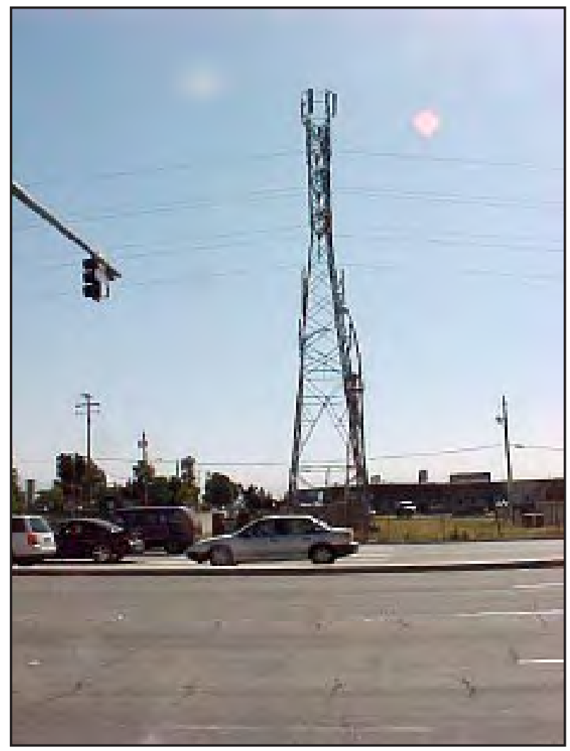
Existing view of electrical transmission tower.

Graphics ... 01277.01 (10-11)