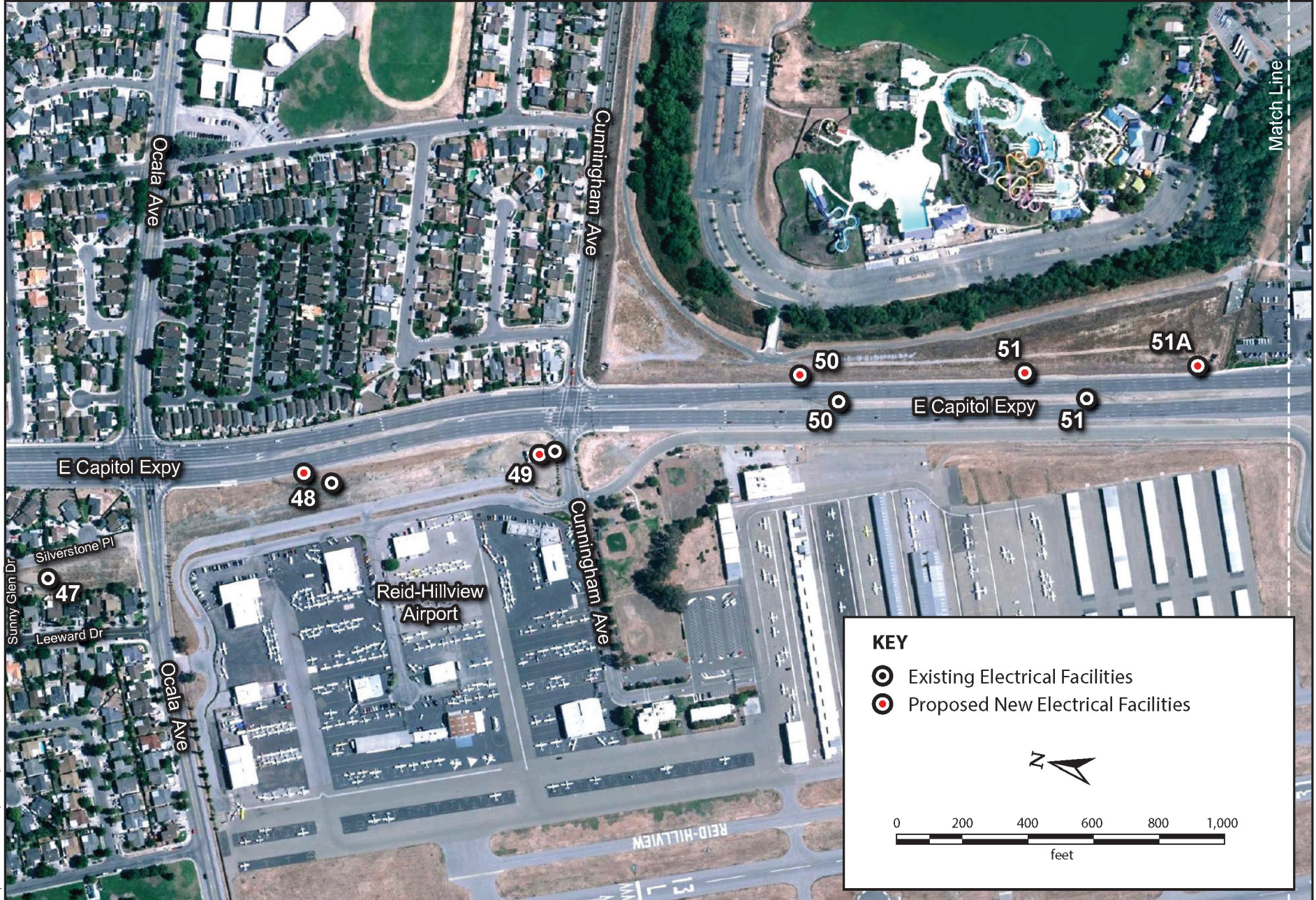
Figure 3-5 Proposed Changes to Electrical Transmission Facilities (sheet 1 of 2)