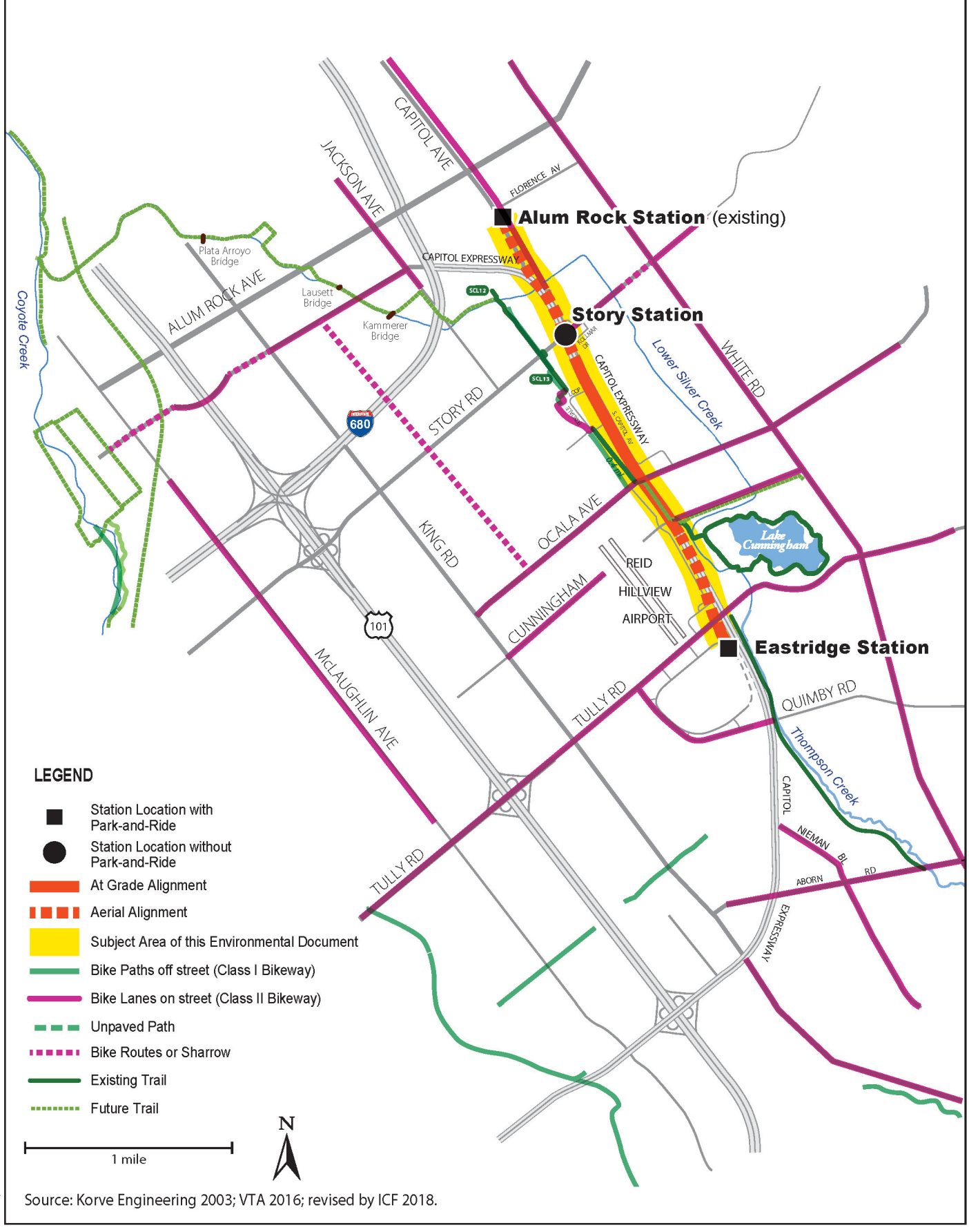
Figure 3-1 Previously Approved Capitol Expressway Light Rail Project