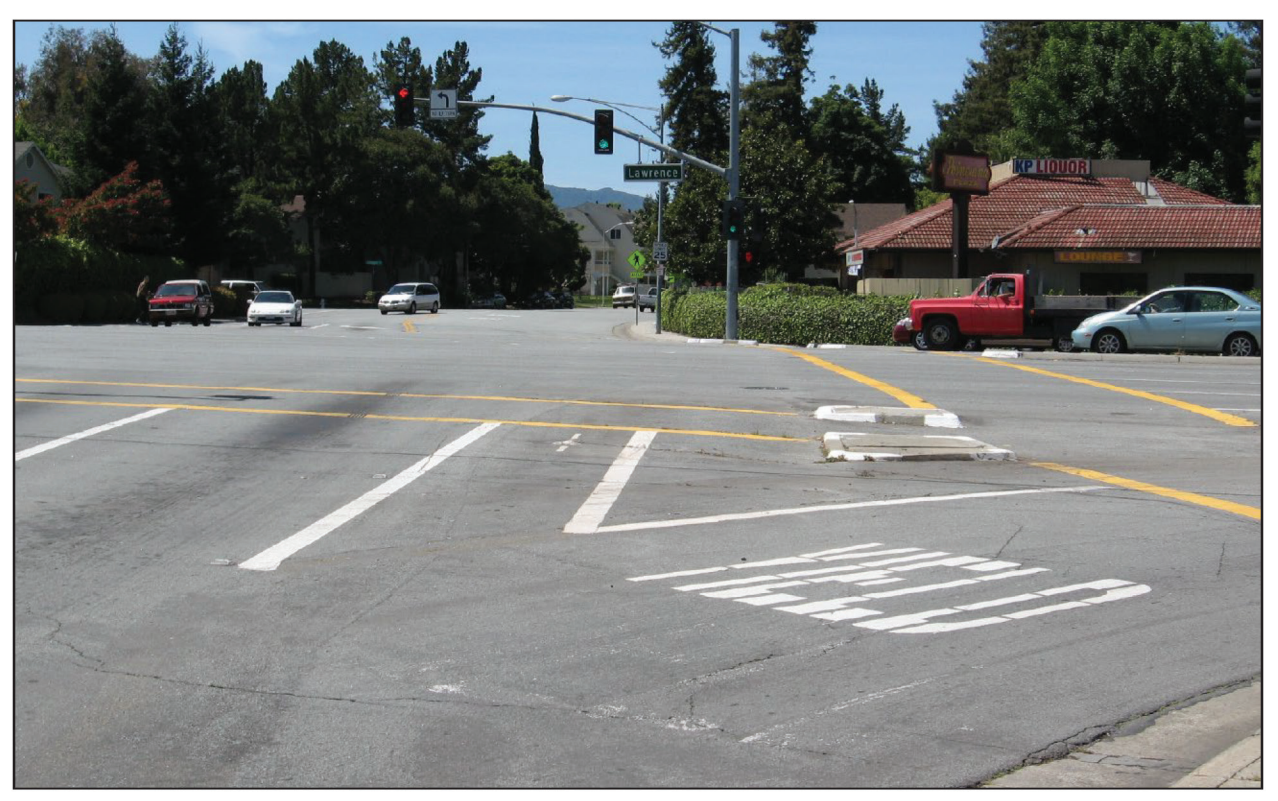
a. View of an example bike slot facing west at Lawrence Expressway and Cabrillo Avenue in the City of Santa Clara.