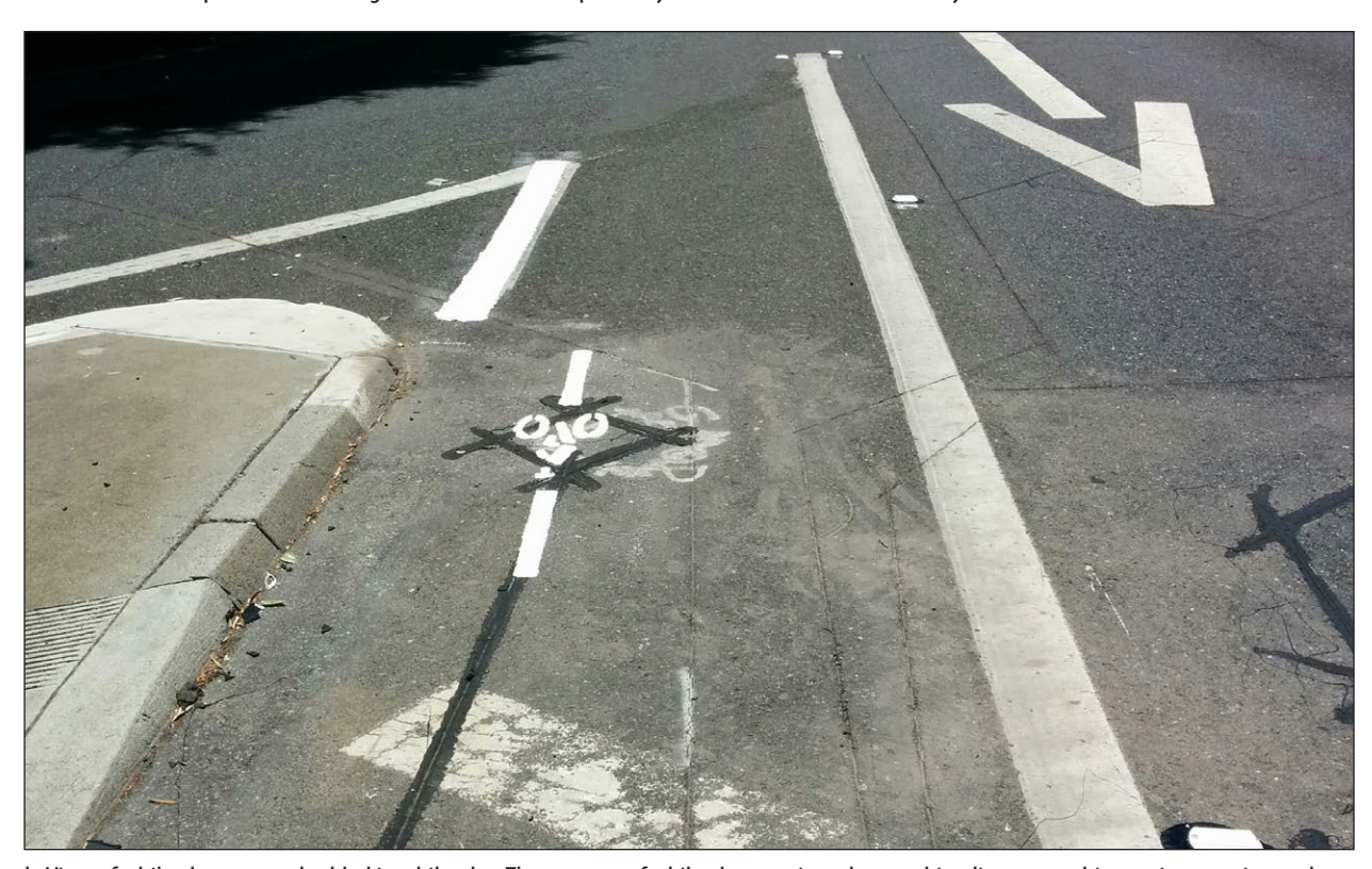
b. View of a bike detector embedded in a bike slot. The purpose of a bike detector is to detect a bicyclist approaching an intersection and communicate with the traffic signal cabinet to provide enough time for cyclists to safely cross an intersection.