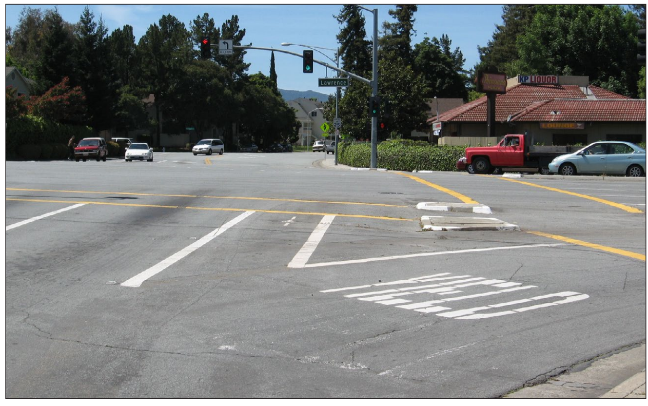
a. View of an example bike slot facing west at Lawrence Expressway and Cabrillo Avenue in the City of Santa Clara.