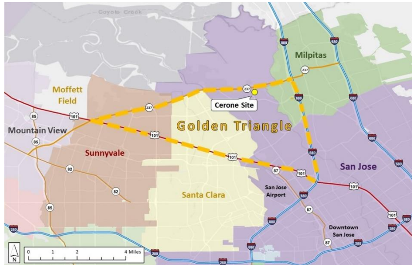
Figure 3. Regional Context Map

Figure 3 shows the Property's location in the larger region. The Property is located in a high-profile location along the State Route 237 corridor between Milpitas and Santa Clara. It lies within the Silicon Valley's "Golden Triangle," which contains a major concentration of technology sector employment and has experienced a high level of new development and redevelopment over the past few years.