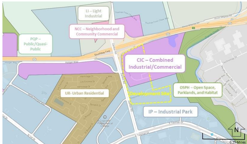
Figure 6. General Plan Designations

CIC-Combined Industrial/Commercial. The CIC-Combined Industrial/Commercial General Plan designation allows a floor area ratio up to 12.0 (one to 24 stories). It is a highly flexible category that accommodates office, industrial, and some retail uses (or mixes of these uses) at varying intensities. The designation discourages small-scale retail, such as suburban strip-centers, but allows larger, big-box projects because they blend the forms and uses of retail and warehouses. The General Plan acknowledges the broadness of the designation and defers to the Zoning Ordinance on matters of use and form at specific sites.