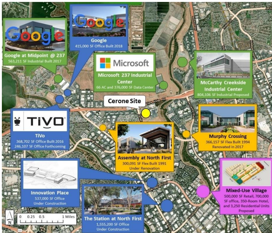
Figure 4. Nearby Commercial/Industrial Investments

The City of San José ("City") defines North San José as the area bounded by State Route 237 on the north, Interstate 880 or Coyote Creek on the east and south and the Guadalupe River to the west. North San José is a largely commercial area characterized by low-density office and industrial parks and campuses.