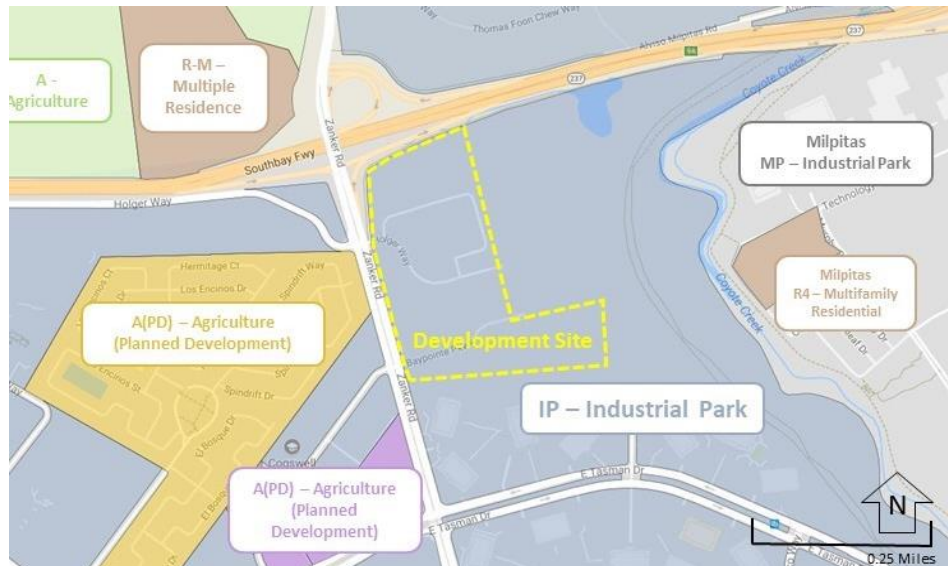
Figure 7. Zoning Designations

Warehouse-style retail is conditionally permitted. When overlaid with a Combined Industrial/Commercial General Plan designation, as it is on the northern parcel of the Cerone Site, Industrial Park zoning permits a “broader range of uses such as retail, church/religious assembly, social and community centers, recreational uses, or similar uses” that do not compromise the overall industrial character of the area. Hotel uses are also conditionally permitted on properties with the Combined Industrial/Commercial General Plan designation.