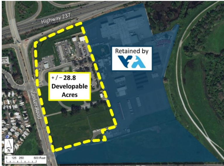
Figure 1. Property

The Santa Clara Valley Transportation Authority (“VTA”), a California special district, issued a Request for Qualifications (“RFQ”) on May 29, 2019 to create a high-quality commercial development (“Project”) for the approximately 28.8 acres of the Cerone site located at the southeast corner of Zanker Road and State Route 237, San José, CA 95134 (“Property”). The general layout of the Property is shown in Figure 1 .