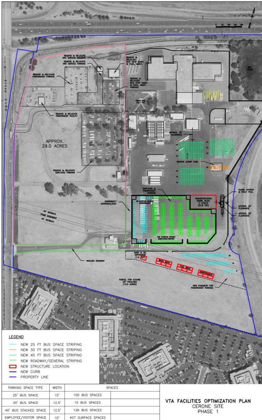
Figure 5. Facilities Optimization Plan, Phase 1

The Cerone Maintenance Yard will continue to be active after the completion of the Project on the developable portion of the Property. In the future, VTA plans to intensify VTA's usage of the portion of the Property that will be retained by VTA. Under VTA's 2010 Facility Master Plan, parking and support areas that are currently outside the fence that encloses the Cerone Division as well as the parking areas currently located on the Property, will be relocated by VTA at the expense of the Developer to an area at the southeast corner of the Cerone Maintenance Yard (an illustrative concept is shown in Figure 5). The Developer will also be expected to incorporate a dedicated bus lane into the Project plans as well as new bus stops serving the Project; the bus lane and new bus stops will be created at the Developer's expense.