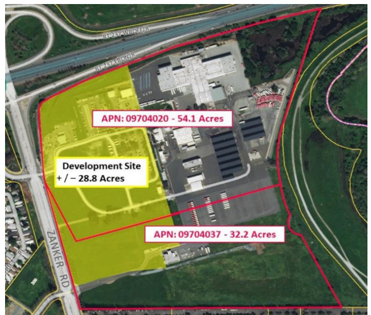
Figure 2. Assessor Parcel Nos.

VTA intends to offer the Property for development under a long-term ground lease from VTA. VTA intends to enter into an Exclusive Negotiations Agreement (“ENA”) with the selected Respondent (who may be a single developer or an affiliated group of developers and/or contractors) whose qualifications and development Proposal VTA